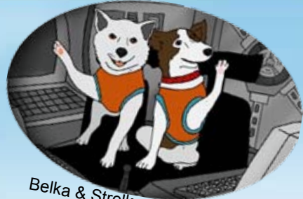
Belka & Strelka - space dogs

For non-specialist teachers: Learn Russian alongside your pupils